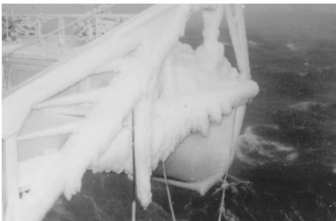
Fig. 4. Ice covering lifeboat, davits, and cables on semisubmersible Ocean Bounty.

Loss of communications would be an unlikely cause of the loss of a platform but could risk crew members' lives if life-threatening events occurred that require rescue or assistance (Fig. 5). Whip and dipole communication antennas readily collect ice because of their small diameters and exposed locations. Water is trapped in the ice, especially if the ice is saline with brine pockets, which raises the dielectric constant and may block signals. Ice also may bridge insulators and short antennas. Loss of radio and radar prevents communication to potential rescuing boats and helicopters. Even though supply boats and helicopters may not be able to reach