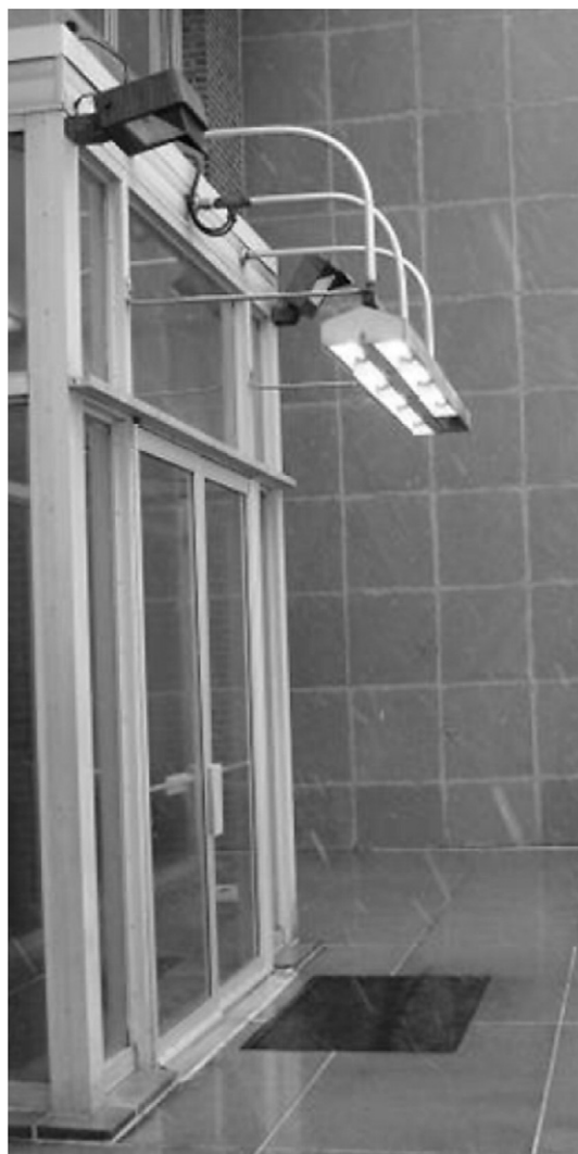
Fig. 10. Infrared anti-icing system protecting front entrance of CRREL.

Manual deicing methods, using wooden baseball bats and mallets, and shovels are the traditional way of deicing marine structures (Fig. 11). Many vessels may have been saved using mechanical deicing