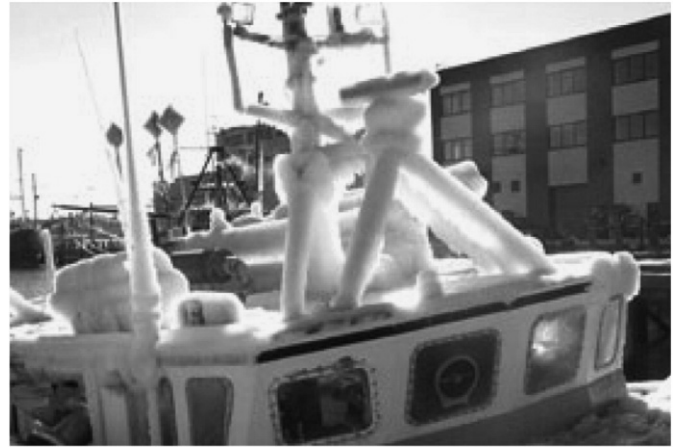
Fig. 5. Superstructure ice covering communications and radar antennas and bridge windows (courtesy Kevin F. Plowman, U.S. Coast Guard).

platforms during icing events due to heavy weather and high seas, ice can persist after weather improves and can keep communication equipment disabled after active ice accretion ceases.