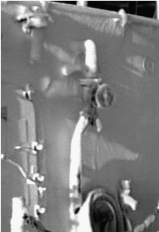
Fig. 3. Iced fire hose hydrant and hose on the U.S. Coast Guard Cutter Midgett in the Bering Sea.

system sensors are blinded, valves freeze shut, and crew cannot move rapidly on decks that are slippery and partially ice blocked. In addition, the ability to deploy escape pods via chutes or davits may be hindered by ice accumulation (Fig. 4).