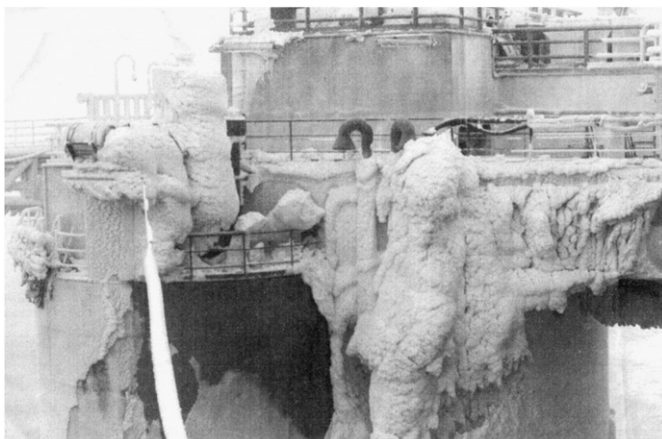
Fig. 2. Superstructure icing on the semisubmersible Ocean Bounty in Alaska (Courtesy U.S. Minerals Management Service).

Ice encasement may cause loss of firefighting capability, fire and gas sensors, rescue equipment such as life rafts, and potentially cause loss of the platform should fire or explosion occur (Fig. 3). Iced safety