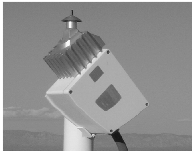
Fig. 13. Probe-style ice detector for measuring freezing rain and freezing drizzle (courtesy author).

Platforms could benefit from a variety of ice detection devices. Imaging and remote detectors, and some conformal detectors, may be