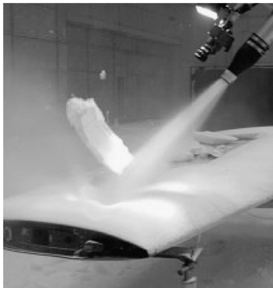
Fig. 9. High-velocity air deicing system with fluid injection removing 10-cm thick wet snow from wing section in experiment at Eglin Air Force Base McKinley Climatic Center.

Infrared energy is a remote method of delivering heat to an object from an electrically or gas-fired emitter (RAS, 2006; Ryerson et al., 1999; Ryerson, 2009). Infrared emitters can deice or anti-ice where conventional, in situ deicing systems might be damaged. Infrared deicing, or anti-icing, is the use of heat to melt ice or to prevent ice from forming. However, rather than requiring a heating element to be placed directly on the surface to be protected, infrared energy is transmitted through the atmosphere from an emitter. Infrared energy is absorbed by the ice to cause melting, or warms a surface to prevent icing. Most infrared energy in the technologies used for ice protection is radiated in wavelengths between about 3 \mu\text{m} and 15 \mu\text{m} . Shorter wavelengths are emitted by hotter emitters, and hotter emitters radiate energy with greater intensity. However, the ability of the