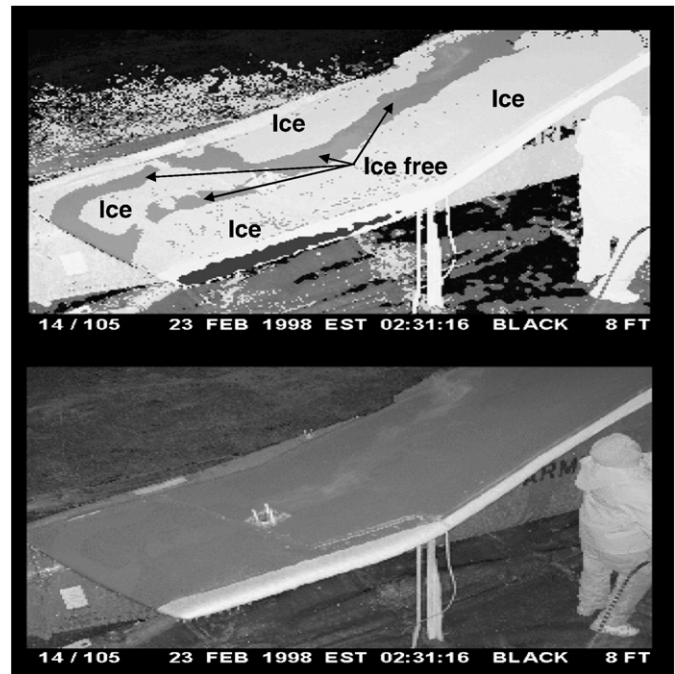
Fig. 12. Ice covered and ice free areas viewed with ice imaging system on helicopter blade in upper image. Lower image taken simultaneously shows difficulty of seeing deiced area without ice imaging system.

Probe ice detectors are the most common type of ice detector in aviation, weather, electrical transmission line, and wind turbine applications. Through many years of use, the characteristics of some of these sensors have become well understood (Tattelman, 1982; Baumgardner and Rodi, 1989; Ryerson, 1990; Ryerson et al., 1994; Claffey et al., 1995; Ryerson and Claffey, 1995; Ramsay, 1997; Fikke et al.,