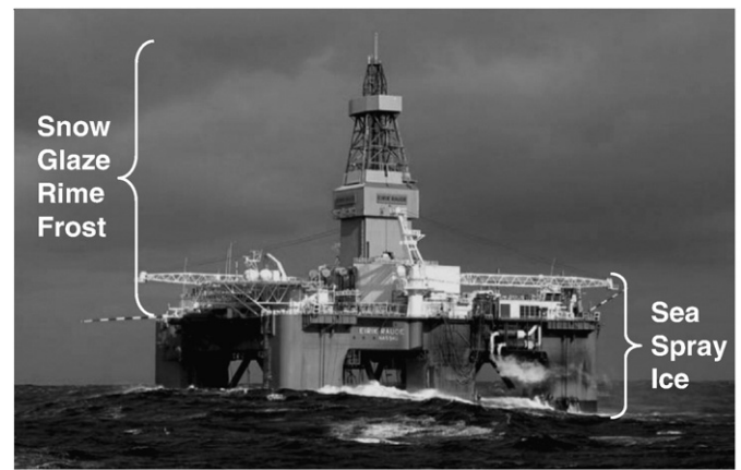
Fig. 1. Potential ice accretion areas, by ice type, on the Ocean Rig semisubmersible Erik Raude (from Paulin, 2008).

A cross-tabular methodology was developed to assess the impact of ice by type on platform function (Table 1). Ice type was ranked by