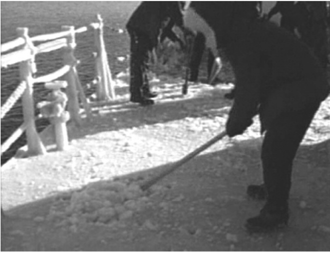
Fig. 11. Manual deicing of superstructure ice with wooden baseball bat on forecastle deck of U.S. Coast Guard Cutter Midgett (from video courtesy author).

methods. However, many may have been lost, because manual deicing was the only option. If decks are inaccessible due to heavy weather, manual deicing is slow or cannot occur. Mechanical deicing also requires a large number of personnel with considerable stamina, exposure to potentially severe weather, and a risk of personnel going overboard. Though manual deicing is cost effective with regard to equipment, it is costly to personnel. Objects on the platform can be damaged or broken from being struck by mallets and bats. Regardless, manual methods will likely always be required for those locations on platforms not fully protected by alternative deicing or anti-icing technologies. In addition, manual methods are an important backup deicing technique if other methods fail.