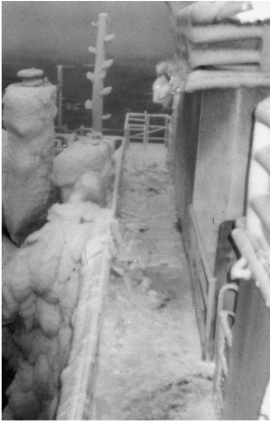
Fig. 6. Iced air vent on right, and ice littering deck of semisubmersible platform Ocean Bounty.

non-lethal accidents and injuries. However, a crane or similar accident could possibly threaten the platform and entire crew if a resulting explosion or fire occurred.